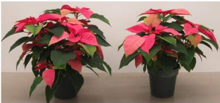
Figure 3. Poinsettia Mars Pink fertilized with 200 ppm N (left) or 100 ppm N (right) of 20-10-20 WSF.