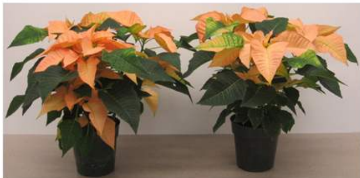
Figure 4. Poinsettia Cinnamon Star fertilized with 200 ppm N WSF (left) was a similar size as plants fertilized with 100 ppm N WSF along with 10% vermicompost by volume incorporated into the substrate (right).

slightly above neutral. For basil (4-week crop) and calibrachoa (5-week crop) plants, substrate solution EC increased with decreasing fertilizer rate and after two weeks of growth, the EC decreased. Macro and micronutrient concentration in substrate and tissue samples decreased with decreasing fertilization rate. Based on tissue analysis, results of this study indicate that basil and calibrachoa can be grown in a substrate amended with 10% vermicompost with liquid fertilization maintained between 50 to 200 ppm N to maintain sufficient nutrient levels in foliage.