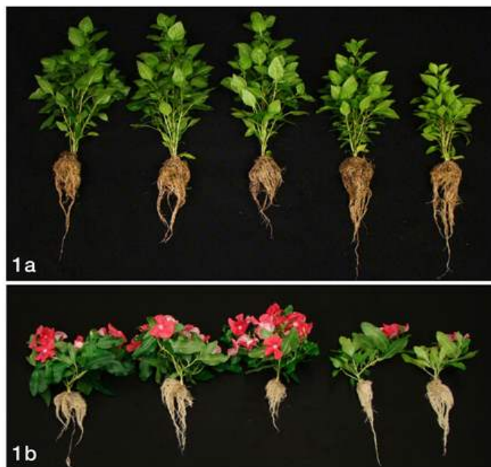
Figure 1. Response of basil (a) and petunia (b) plants grown in (from left to right) substrate not amended with vermicompost (control) and fertilized with a water-soluble fertilizer (WSF) at 200 ppm N, or substrate amended with 25% vermicompost and fertilized with 150, 100, 50 or 0 ppm N derived from a WSF.

Substrate solution was again extracted from representative plants each week utilizing the pour-through method and the substrate solution was analyzed for pH and EC. Substrate and foliage (recently