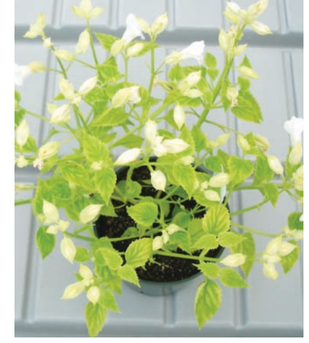
Figure 5. The loss of plants due to diseases, insects, nutritional deficiencies or toxicities and ethylene also contribute to shrink.

Assuming you have minimized your propagation and production