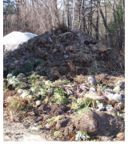
Figure 4. Adding in extra weeks as a "cushion" will cause you to miss your target date or produce plants that will be overgrown and lower quality – both making your compost pile grow.

Look at the plants themselves to identify insects, mites and the damage they cause. Record observations and review these regularly to identify any trends in infestations. Don't get tunnel vision when scouting for insect pests, look for disease and nutritional