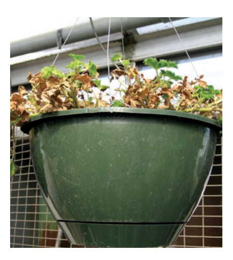
Figure 6. Check your heaters frequently as faulty heaters can release ethylene and damage sensitive crops such as geraniums. Catching a problem early will make treatment much easier and will reduce the number of plants affected.

Once your plants reach the retail environment, it is essential they are provided with adequate environmental conditions to sustain photosynthesis. Low light levels and warm temperatures in post harvest will lead to leaf and flower senescence and overall poor quality. Likewise, low light levels and excessively cold temperatures are detrimental for crops such as poinsettias, orchids, and tropical plants. Ethylene is also a factor that